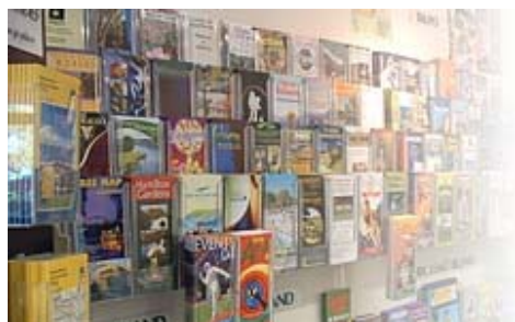
(3) To fade the photo to white, fill the blank layer with solid white.