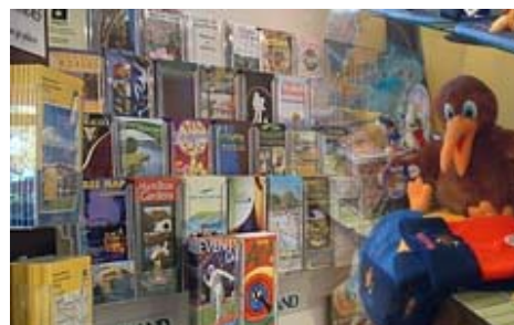
(4) To fade the photo into another image, place the second image in a layer below the photo.