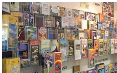
(1) The original image.