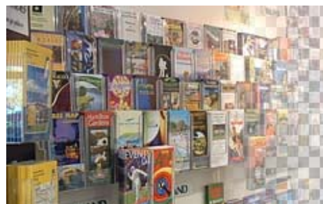
(2) With the gradient applied, you can see the checkered pattern which indicates the blank layer.